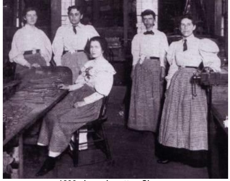
1890s Leg-o'-mutton Sleeves

After 1892, the puff expanded around the upper arm. Leg-o'-mutton (or gigot) sleeves, characterized by their extreme fullness and puffiness from the shoulder to the elbow were fashionable at this time. Prior to 1895, sleeves were drooping.