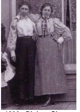
1890s Bishop Sleeve

The bishop sleeve (a full sleeve extending from shoulder and gathered at the wrist) still remained popular, although not as stylish and contemporary.