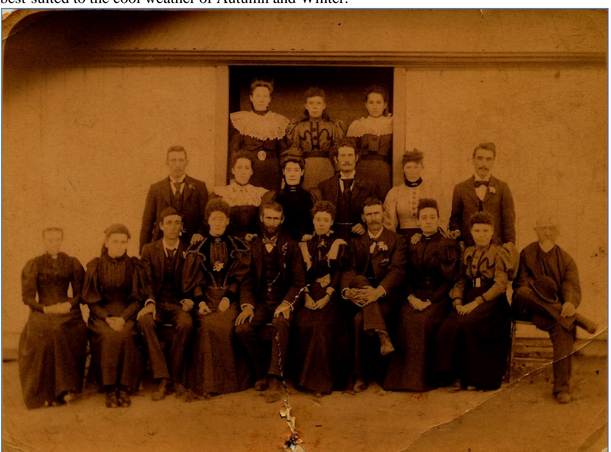
Picture 2: The mystery photograph with improved exposure and contrast

All of them are wearing formal dress, mostly in dark colours. All the men sport boutonnieres (flowers in their buttonholes) perhaps signaling a wedding occasion. The immediate impression given by the photo is that this is an extended family group that has gathered to celebrate a family occasion in the building behind them. They are all wearing clothing that is best-suited to the cool weather of Autumn and Winter.