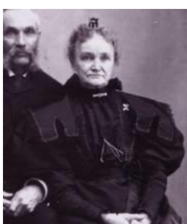
1896 Full Sleeves

By 1898, the sleeve was tight, with a small, full, ball-shaped puff set very high on the arm.