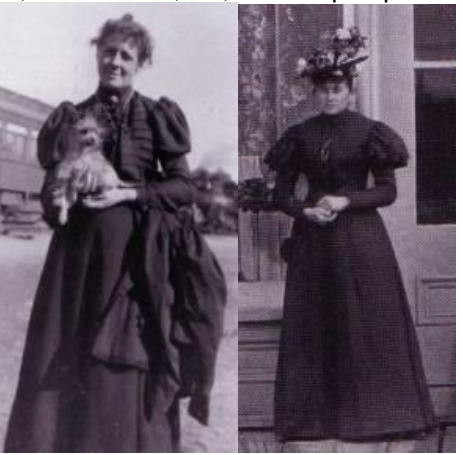
1898 Tight Sleeve with Small Puff`

By 1898, the sleeve was tight, with a small, full, ball-shaped puff set very high on the arm.